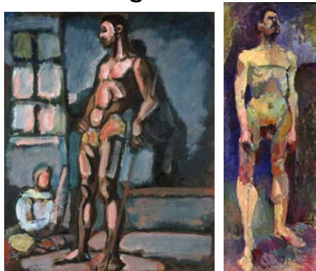
Georges Rouault, Le Modèle, souvenir d'atelier , 1895 repris vers 1950 ?, Coll. part. via la Fondation Georges Rouault, Paris