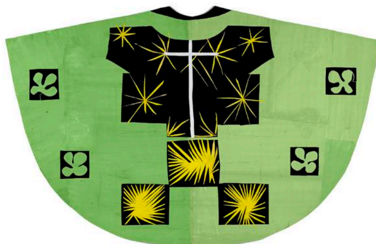
Henri Matisse, Maquette pour la chasuble verte (face), 1950-1952 Papiers gouachés, découpés, collés et marouflés sur toile, 126,5 x 198 cm Musée Matisse Nice.