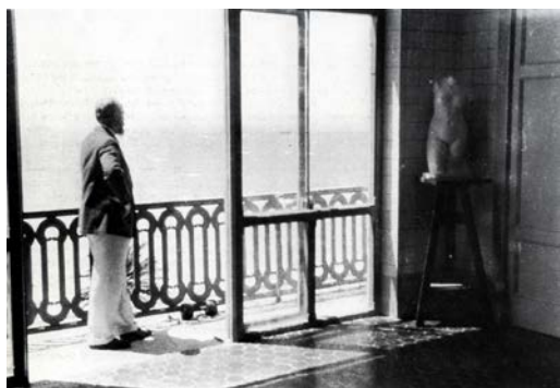
Matisse sur le balcon de l'appartement de la place Charles-Félix, Nice, vers 1929.

For the hundred years of his discovery of the city in 1917, the museum dedicates a room, Matisse in Nice , to the very strong links between the artist and his city of preference.