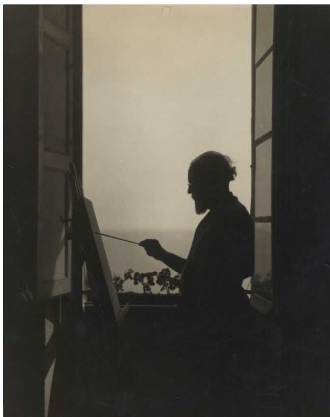
Henri Matisse painting, studio of the cours Saleya, near 1927